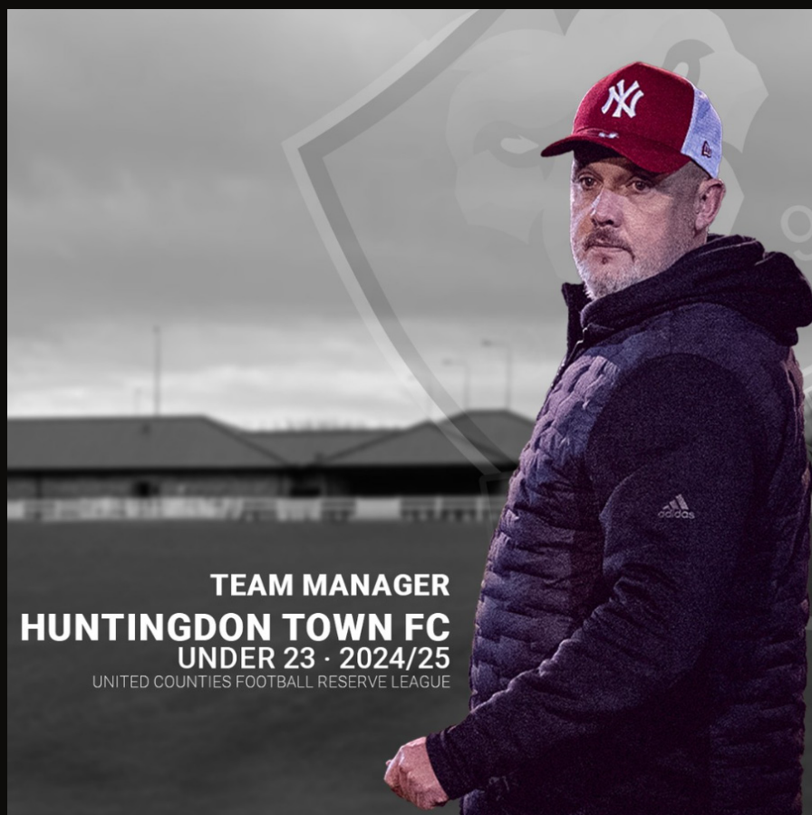
TEAM MANAGER HUNTINGDON TOWN FC UNDER 23 · 2024/25 UNITED COUNTIES FOOTBALL RESERVE LEAGUE